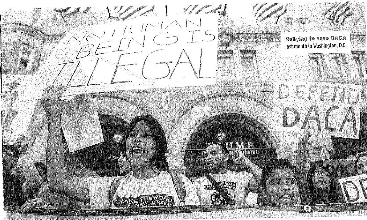
Rallying to save DACA last month in Washington, D.C.

Notes on my thoughts, reactions and questions as I read: